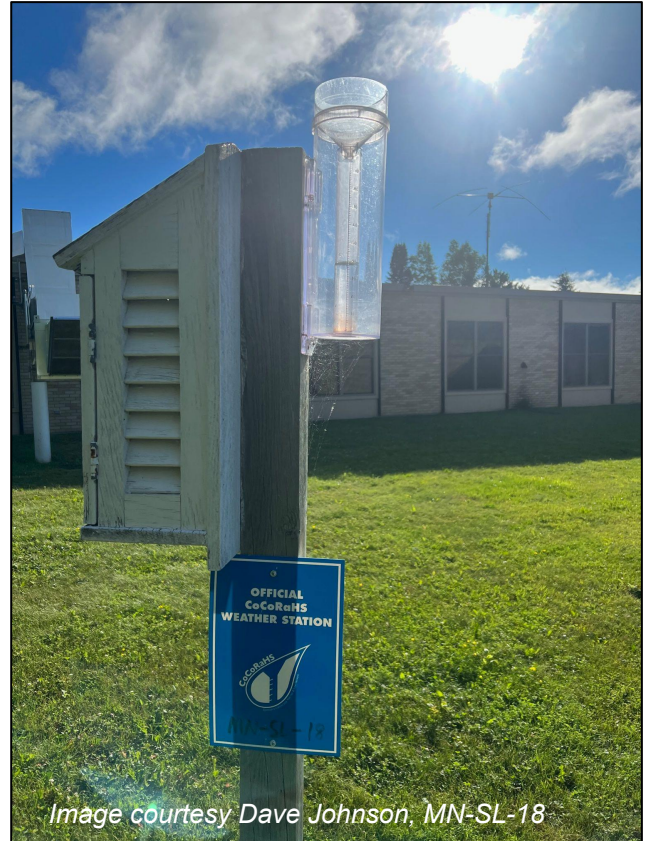
MN-SL-18